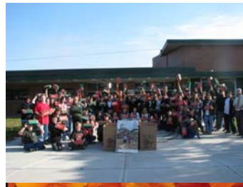
8th Graders with their packed shoeboxes

to put together 85 boxes. From there we spent the rest of the week giving each 8th grader a shoebox to fill with all kinds of presents. We put things like caps, shirts, toys, candy